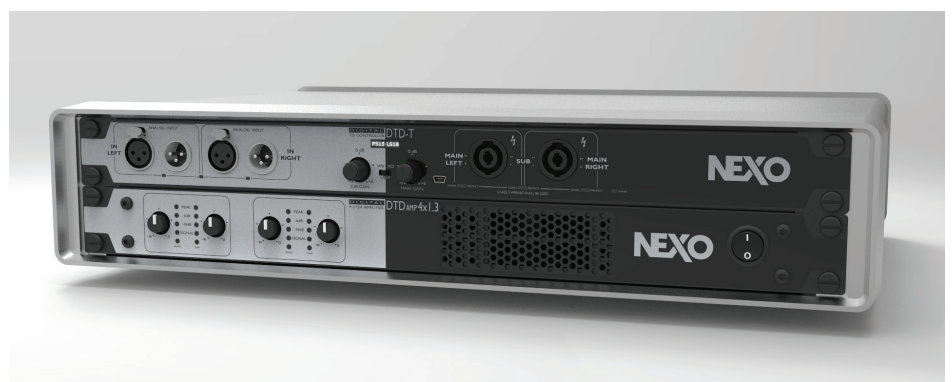
DTD Controller + DTDAMP: input/output patch bay, processing and 5 kW of power in a 2U light rack.

When used with the Nexo DTD controller the DTDAMP is the perfect solution for "Dry" hire or where the user has a limited knowledge but still allowing the best possible result from the Nexo speaker system.